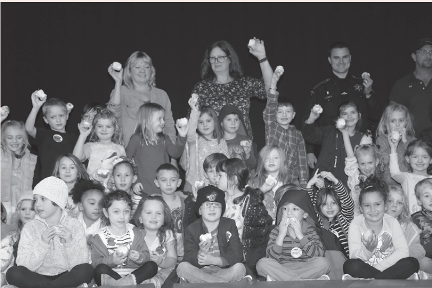
Woodstock Elementary School students pose with their apples during the Big Apple Crunch event in October.

WOODSTOCK ELEMENTARY SCHOOL celebrated one of our region’s most delicious and healthy products on October 25 by participating in the Big Apple Crunch, a statewide challenge sponsored in part by the New York Apple Association. All across New York State, students bit into a local apple on the same day, at the same time. All three Onteora elementary schools participated.