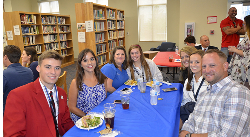
Legacy Lunch - September 20, 2018