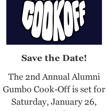
2019. More information will be sent out soon to

in Business Finance and is a member of the Men's Track & Field team. He