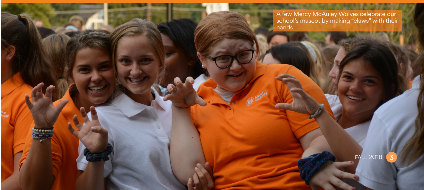
A few Mercy McAuley Wolves celebrate our school's mascot by making "claws" with their hands.

To view our most recent alumnae milestones and sympathies, visit: mercymcauley.org/alumnae/news .