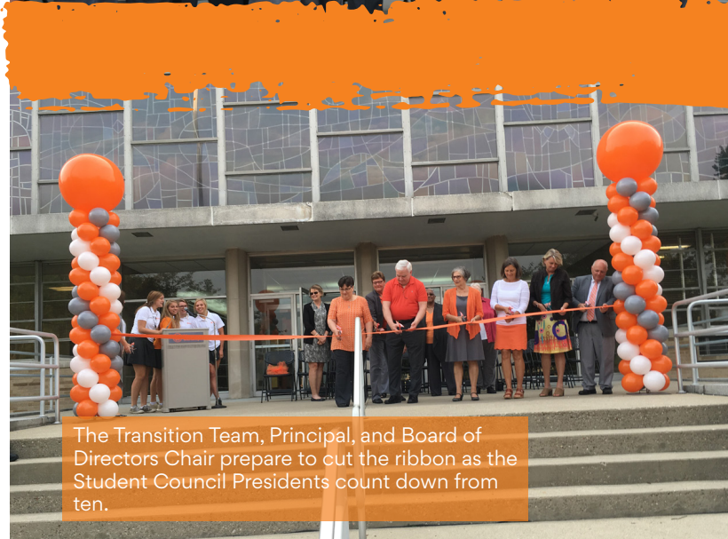
The Transition Team, Principal, and Board of Directors Chair prepare to cut the ribbon as the Student Council Presidents count down from ten.