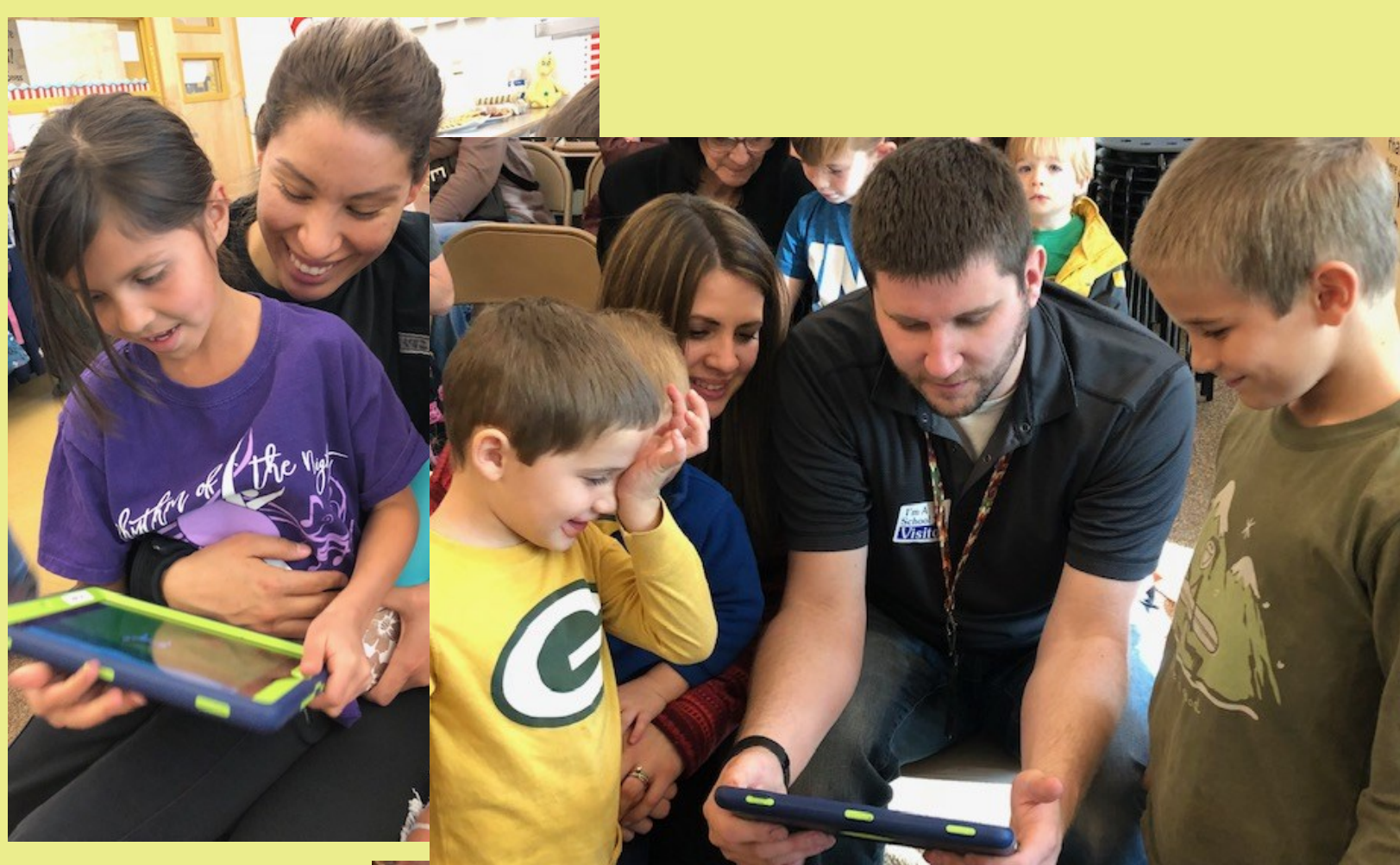
2nd Grade students sharing the games they designed using their coding skills.