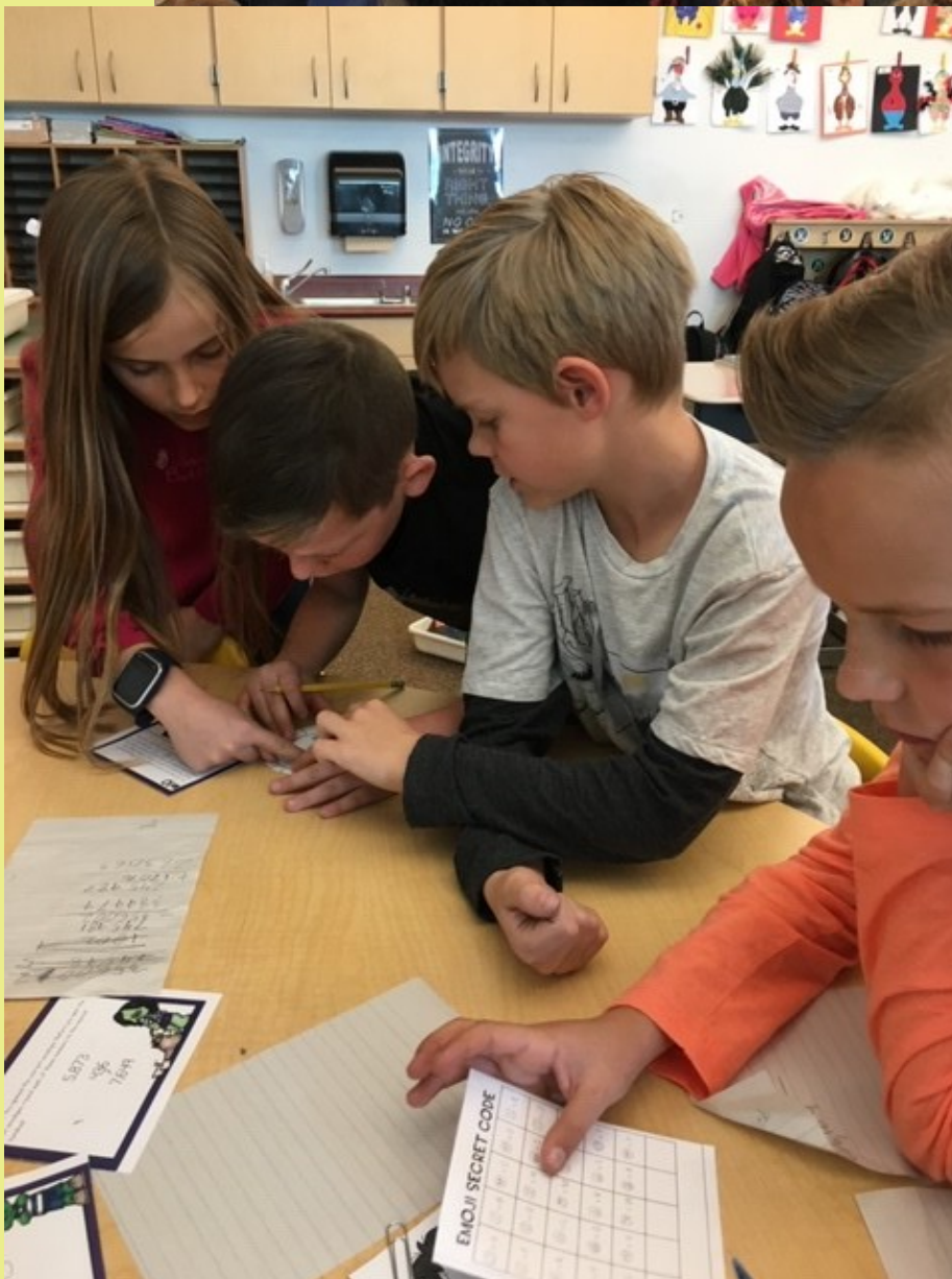
4th Grade ESCAPE ROOM MATH PROBLEM SOLVING