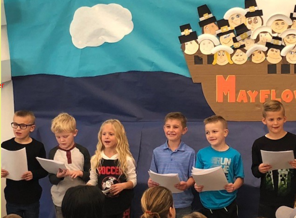
2nd Grade Thanksgiving Reader's Theater