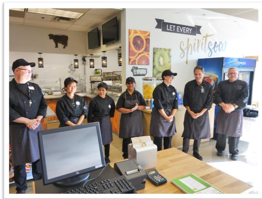
Photo: Sage Dining Services Staff at the Welcome Back Breakfast

The Board of Governors breakfast was our first introduction into the school community. It was an event that we were looking forward to as it was finally time to put the wonderfully renovated kitchen to use. The staff and the board members were very friendly and open, they made us feel welcome right away.