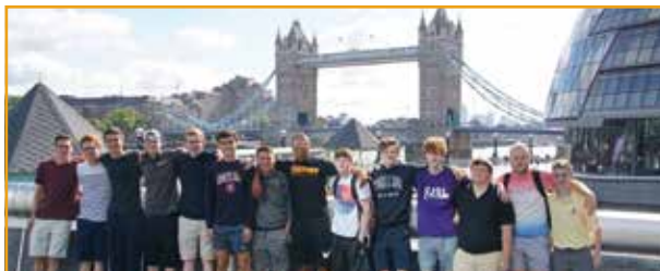
In 2018, students traveled to the United Kingdom for summer break.