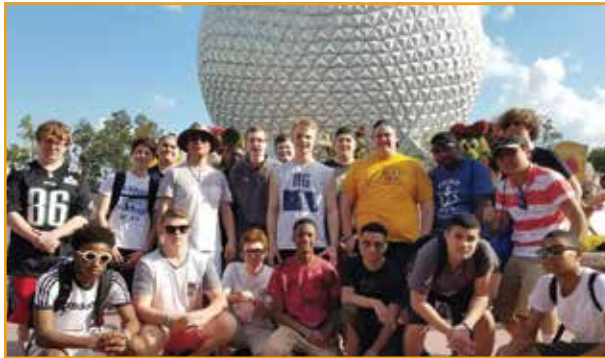
In 2018, Roman's music department performed in Walt Disney World.

Along with competitive athletic programs, Roman offers a wide array of extracurricular activities. Students, who get involved make new friends, learn new skills and make a difference in the lives of others. In the Cultural Clubs, students learn about different customs and traditions. In service organizations, students engage the elderly, young children and the less fortunate, helping to bring joy and happiness to their lives. Whether it is writing an article for the school e-newspaper or literary magazine, representing the school as a student ambassador, acting in a musical or serving Mass at the Cathedral, only at Roman can you be exposed to so many opportunities to learn and grow. At Roman, every student is expected to get involved and is challenged to use and develop their talents, to become active and engaged in the life of the school.