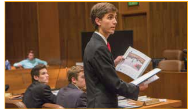
Roman's nationally ranked Mock Trial team has won five consecutive City Championship and have been State Finalists four times!