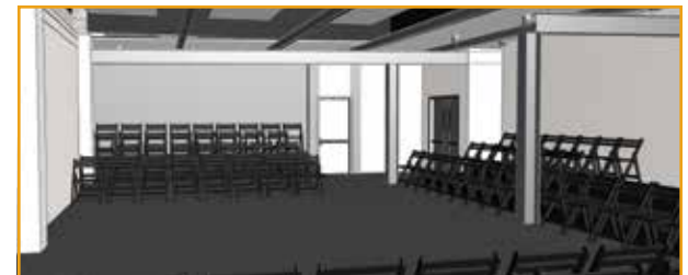
Black Box Theater