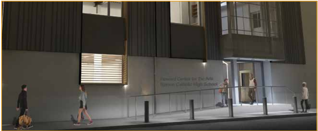
Main entrance to the Howard Center for the Arts