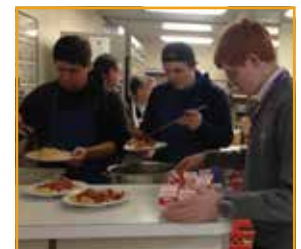
Community Service Corps