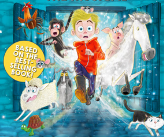
Illustration © Jim Field 2016. Licensed by HarperCollins Publishers Ltd.