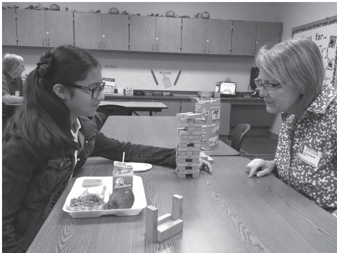
Hollibrook student and mentor enjoy a game of Jenga