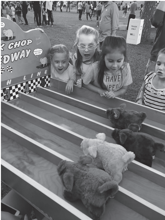
Nottingham Elementary carnival was part of the school’s recent anniversary events.