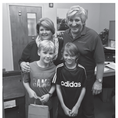
Hunters Creek students donated their birthday gift cards to others.