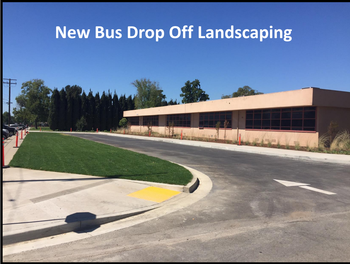
New Bus Drop Off Landscaping