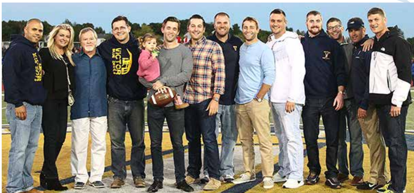
photo taken at this years Victor Homecoming Football game, Saturday, October 8th on Corbit Field