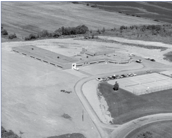
Photo taken of the Elementary School, 1955.

Next month is the 60th anniversary of the dedication of the Victor Elementary School. In 1955 it was built to house grades K-6 grades. Since that time, there have been several additions, and it has become the Victor Primary School. When the school opened, there were 643 students enrolled in grades K-6. Today there are 653 students in the Primary School. The Primary School houses our grades K-3 multi-age program and all of our second and third graders. The original school on campus, now the Early Childhood School, houses Preschool, and the rest of our Kindergarden and First graders, a total of 697 students.