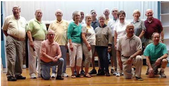
On stage at the old high school