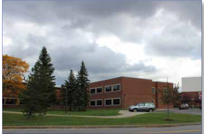
Photo taken of the same building, now the Junior High School with additions, 2015.