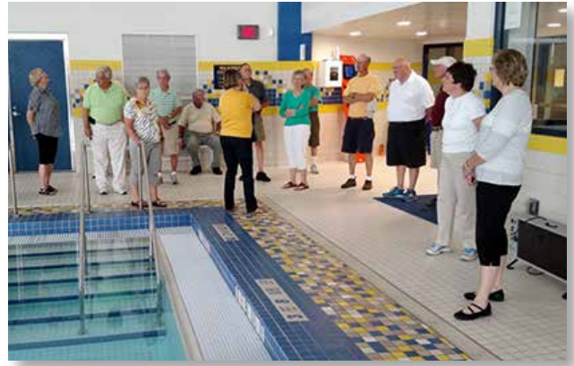
Tour of the new Aquatic Center.