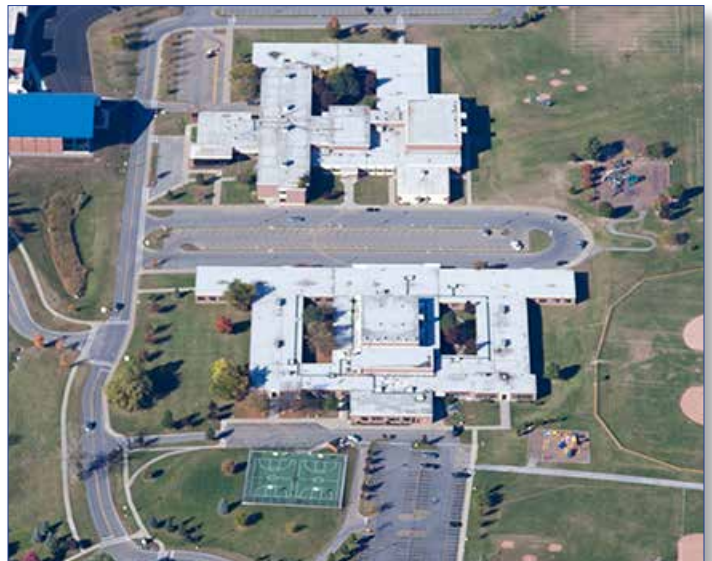
Photo taken of the same building, now the Primary School, along with the Intermediate School building, 2014. The Primary School is the building at the bottom of the photograph, and the Intermediate School is the building at the top of the photograph.