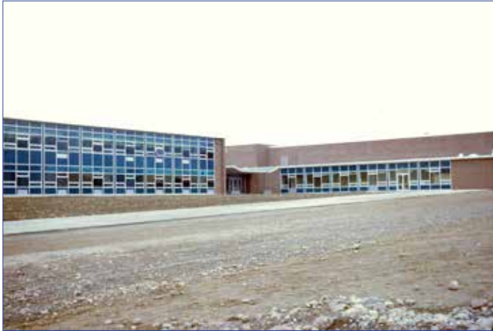
Photo taken of the Senior High School, 1965.

This year marks the 50th anniversary of the high school. The original high school on this campus was dedicated on March 14, 1965. The building has since morphed into the Junior High School, with an entirely new high school built adjacent to the original building.