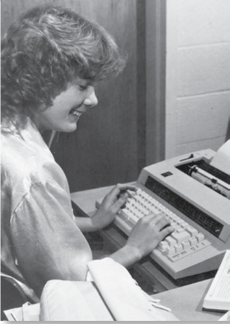
Senior High student in typing class from the 1987 BAGÉL.