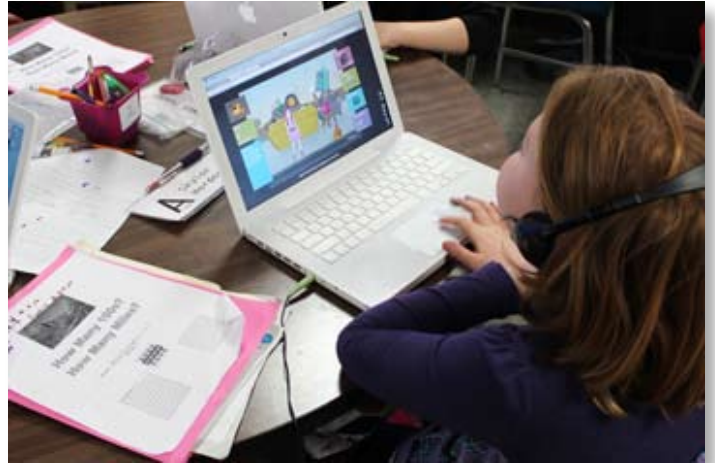
One of our younger students working on a laptop.