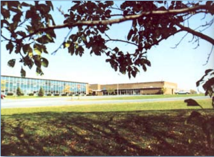
photo from 1983 yearbook Senior High School