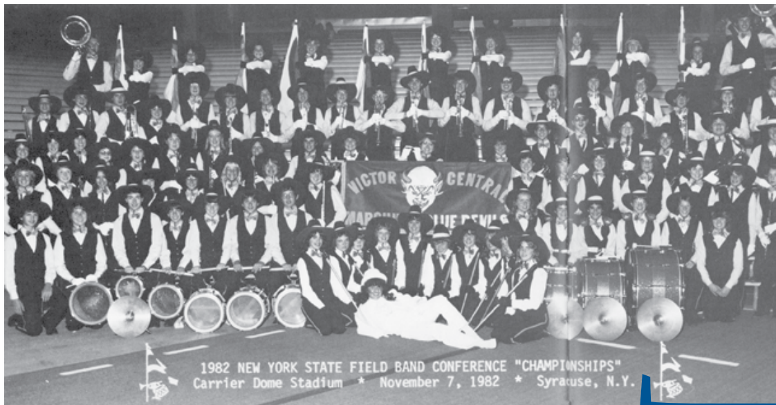
1982 NEW YORK STATE FIELD BAND CONFERENCE "CHAMPIONSHIPS" Carrier Dome Stadium * November 7, 1982 * Syracuse, N.Y.