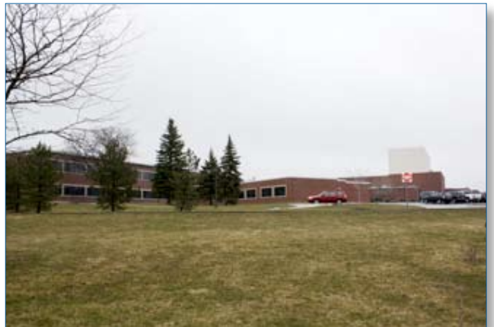
photo taken March 31, 2011 Junior High School