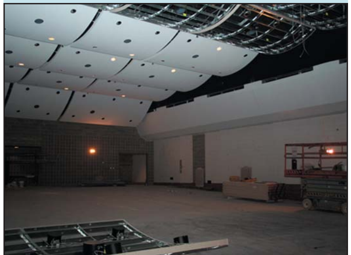
Victor Junior/Senior High School Auditorium Ceiling Cloud Construction, May 2007

In addition to the new auditorium, three large instrumental music rooms and a high tech music lab will be added. These new fine arts facilities will be enjoyed by VCS staff and students for years to come.