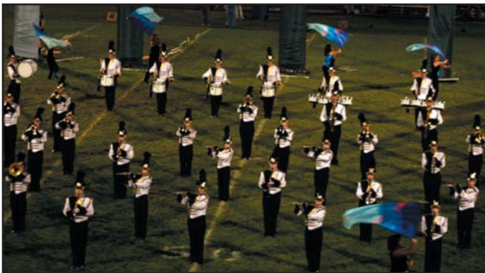
The Marching Blue Devils Field Band was named Division I Champion at the NYS Field Conference.