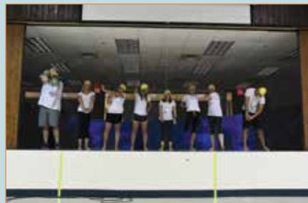
Shabonee staff kicked off the year with a parody of a synchronized swim team routine.

Shabonee School was recognized by the Positive Behavioral Interventions and Support (PBIS) network for achieving Platinum status this fall. This is the highest acknowledgement that can be earned by the PBIS network for implementing all aspects of the PBIS system with fidelity.