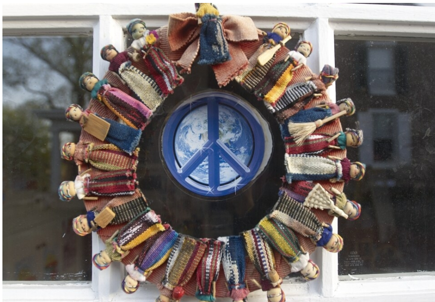
Indigenous Dolls Peace Wreath