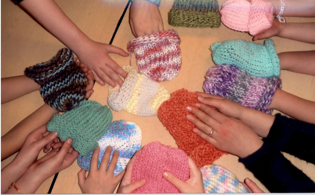
Knitted Baby Caps