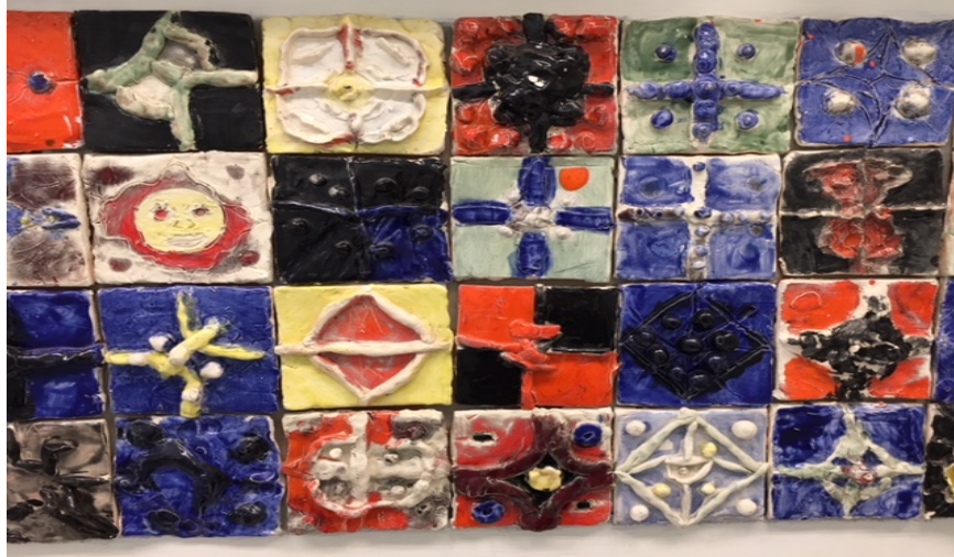
Fired Tiles Mural 2005