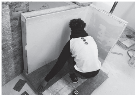
A student practices floor installation.

Students learn how to frame residential floors and walls, install sub-flooring, residential wiring and drywall. In addition, they place ceramic tiling, hardwood, vinyl and laminate flooring and design and install a tiled backsplash. This construction and woodworking course is one example of a learning choice that has a career-based focus. Opportunities like this help students practice and develop skillsets to help them now and in the future.