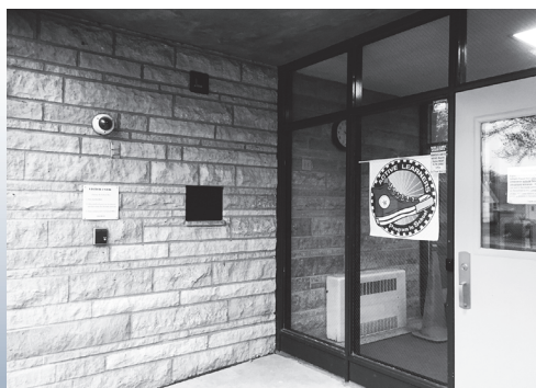
A security camera at entrance of a Mankato Area Public School building.