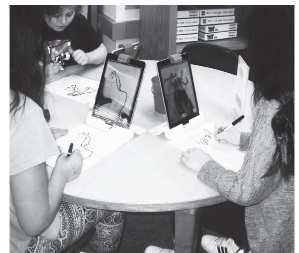
Students work with Osmo kits in the makerspace funded by Educare at Monroe Elementary School.