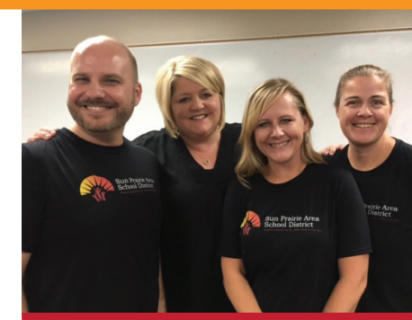
Our Mentor Team

new teachers right within their classroom environment. Mentors guide beginning teachers to create learning environments and instructional practices that are equitable and accessible to all students. Sun Prairie School District demonstrates a strong commitment to the growth and retention for our new teachers and their students by providing a formal mentor during this once-in-a-lifetime induction phase into education. ●●●