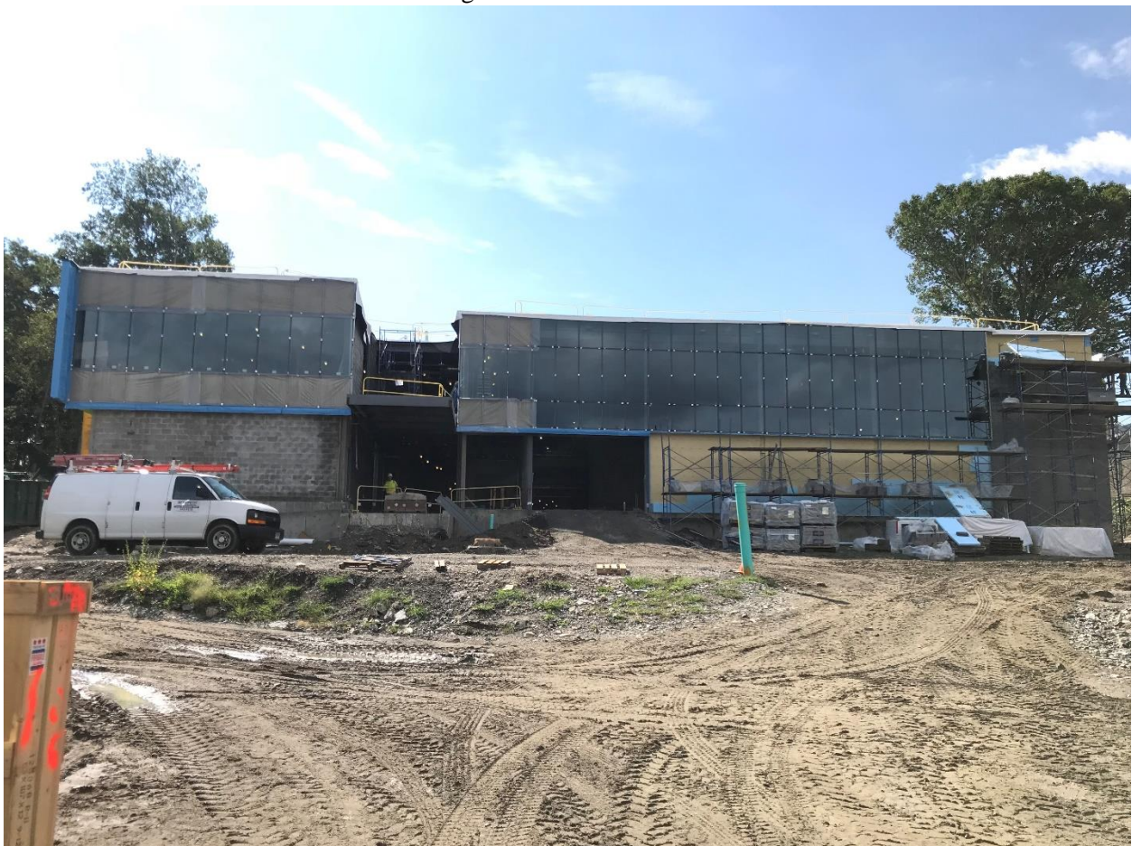
Building North facade – 9/19/2018