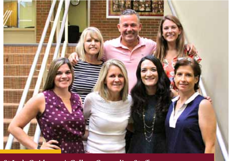
St Joe's Guidance & College Counseling Staff