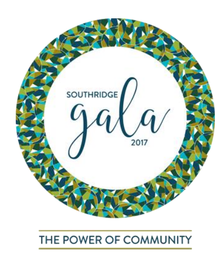
Saturday, November 18th