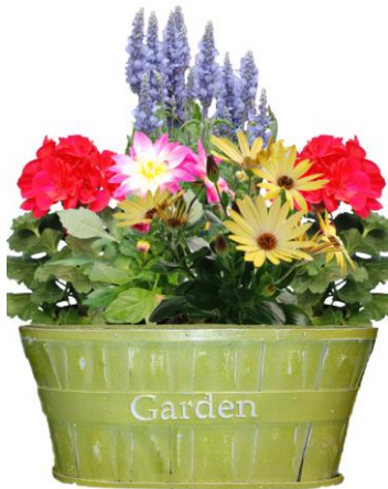
14" Oval Garden Planter