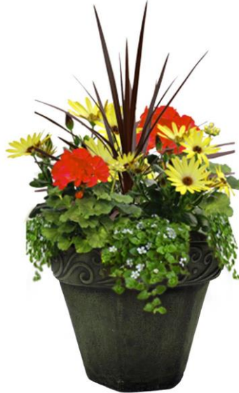
12" Swirl Planter