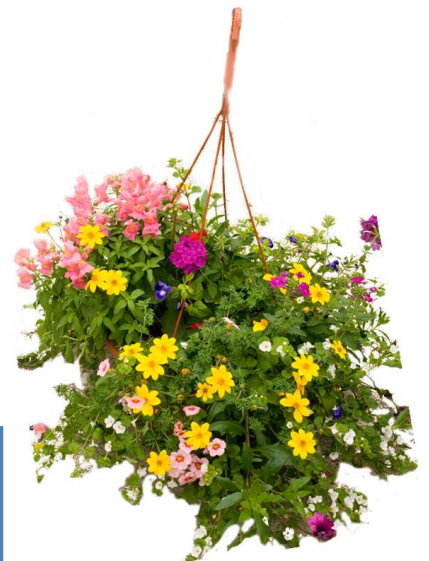
12" Mixed Hanging Basket