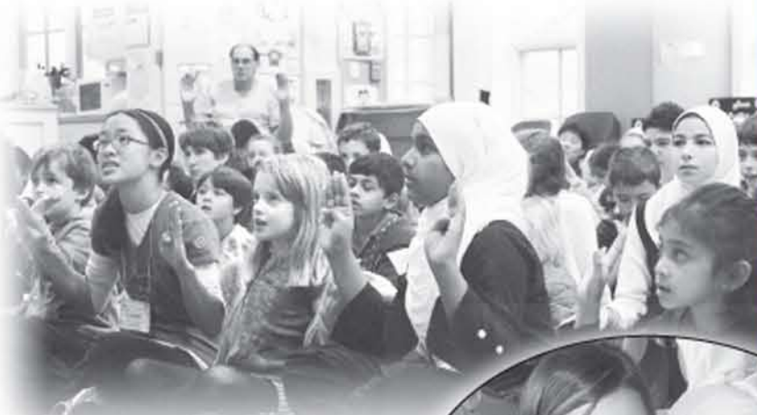
Students from Princeton Friends School and Noor-Ul-Iman School end their time together in song with hand motions.

Since September 2002, students from Princeton Friends School (Princeton, NJ) and Noor-Ul-Iman School , a local Islamic school, have been getting to know one another and their school communities. They have exchanged almost-monthly visits to each other's schools, sharing stories and cooperative games, contemplating together in the mosque and the Meetinghouse, singing songs and playing soccer. The partnership started with a simple idea of pen pals and class visits, and grew into a program that now involves every first to eighth grade student at PFS, both hosting and visiting Noor-Ul-Iman. Students are paired, some of who have been partners for many years. Teachers from both schools have become familiar colleagues and friends, sharing ideas and common concerns. There have been challenges that keep PFS defining their understanding of community, continuing to learn about themselves and others, and grappling with differences by seeking common ground. One of the founding teachers refers to the partnership as sowing "seeds of peace."