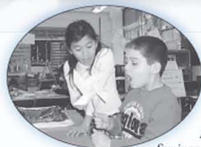
Friends Seminary fourth grader teaches PS #19 student about cause and effect through pinwheel construction.

A fourth grade class at Friends Seminary (New York, NY) is excited to teach first grade student buddies at Public School #19. Each week FS students discuss the goals and strategies for the lessons they will teach and any concerns or particular teaching challenges they have. Since Public School #19 students are learning about cause and effect, each fourth grade student develops a lesson plan where the focus is to teach the cause and effect relationship between wind and movement through constructing a pinwheel. The process of creating a lesson plan forces each fourth grade student to consider his/her behavior and impact on learning from a different perspective. No longer are they the students, but rather, they are now the teachers. The essential question their lessons address is: What do I need to do in order to effectively convey my lesson and for my buddy to learn? Whether the goal is academic improvement, personal development, or both, students learn problem solving, critical thinking, communication skills, teamwork, civic responsibility, and what it means to care about and for others.