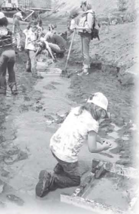
Friends Select School second grade students join Academy of Natural Sciences scientists at a private New Jersey paleontological dig site.