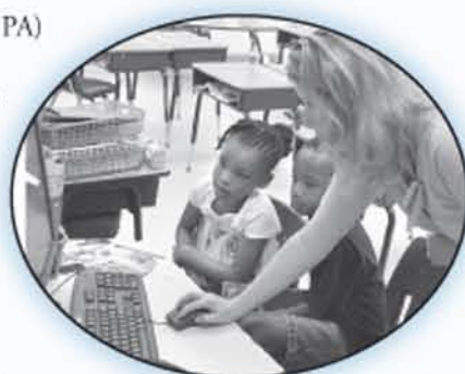
Westbury Friends School students work in tech lab refurbished by donations from Adelphi University.

The city of Philadelphia is quintessential to the Friends Select School (Philadelphia, PA) experience and has enabled FSS to create strong partnerships with the city's cultural and science institutions. From PreK–12, FSS students learn to use the city's resources to engage learning in critical and lasting ways. A new educational connection, forged between FSS and the Academy of Natural Sciences, provides weekly lessons to second and third graders at the Academy taught by museum staff and designed in partnership by the Academy's education department and the FSS lower school science specialist. A partnership with the Philadelphia Museum of Art complements the ninth grade study of medieval Europe. Museum curators guide students through their research so that each student can place pieces in historical context, explain aesthetics and understand the importance of the artists. Every spring, the partnership culminates in a public presentation by students. This experience deeply engages students in learning critical research and oral presentation skills, along with art appreciation. This 20-year-old partnership remains a vital capstone experience for FSS students.