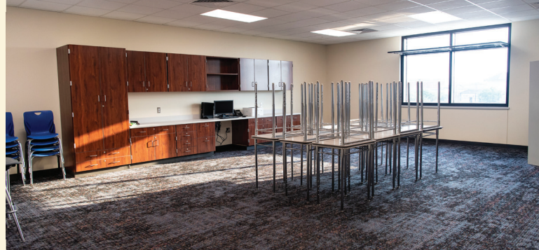
New classrooms in the MSS addition (and at MSN and HS) will be ready for students on August 16.