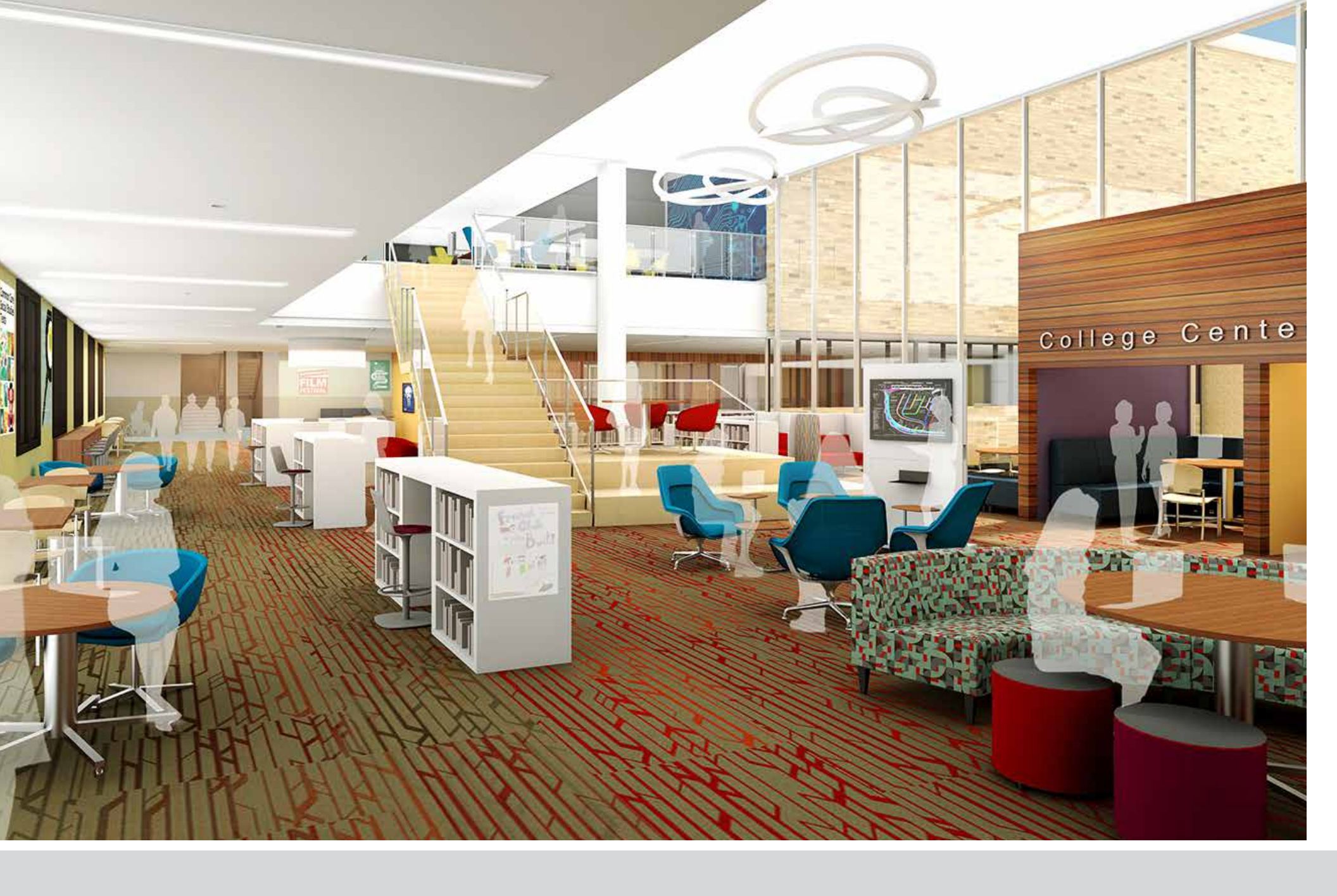
McAuley Achievement Center. The current library will be transformed into a learning hub, the heart of McAuley. The McAuley Achievement Center will symbolize the dynamic, open, and relational nature of learning today. It will incorporate spaces suitable for a diverse range of learning and teaching styles, from quiet study to group projects. It will connect students with important academic and personal support resources.