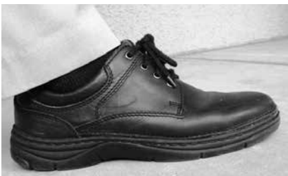
Daily Shoe: Worn with Daily Khaki Uniform.