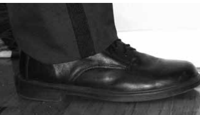
Dress Shoe: Worn with Drill and Dress Uniforms.