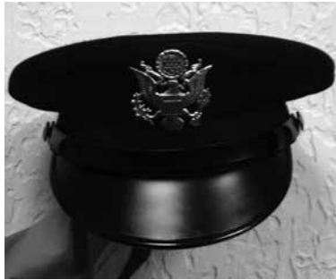
3rd - 7th Grade Hat