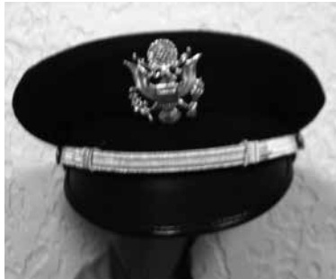
8th Grade Hat