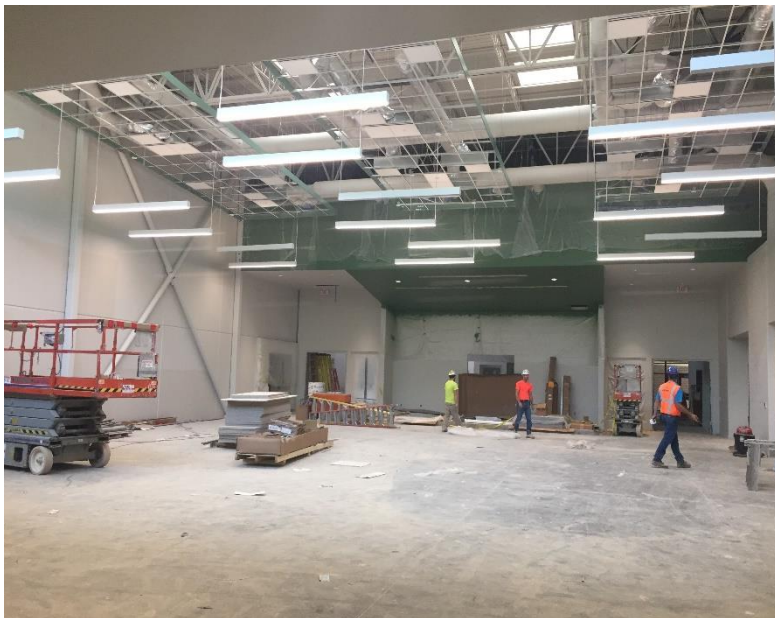
Hanging high ceiling grid & hanging lighting fixtures in Area C.