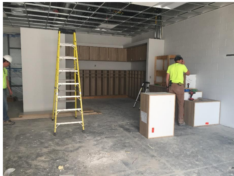
Setting casework & hanging ceiling grid Area B