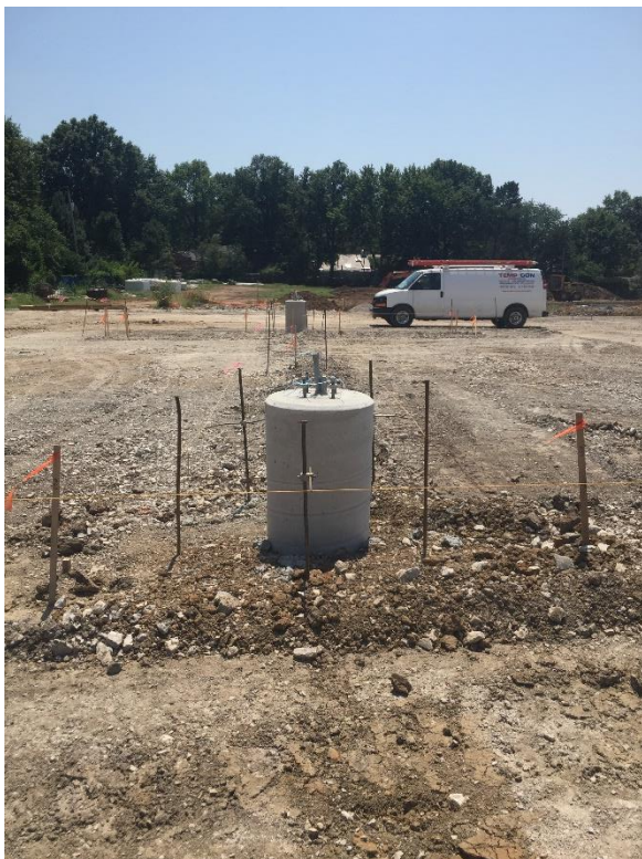
Pouring light poles & grading South and East lots.