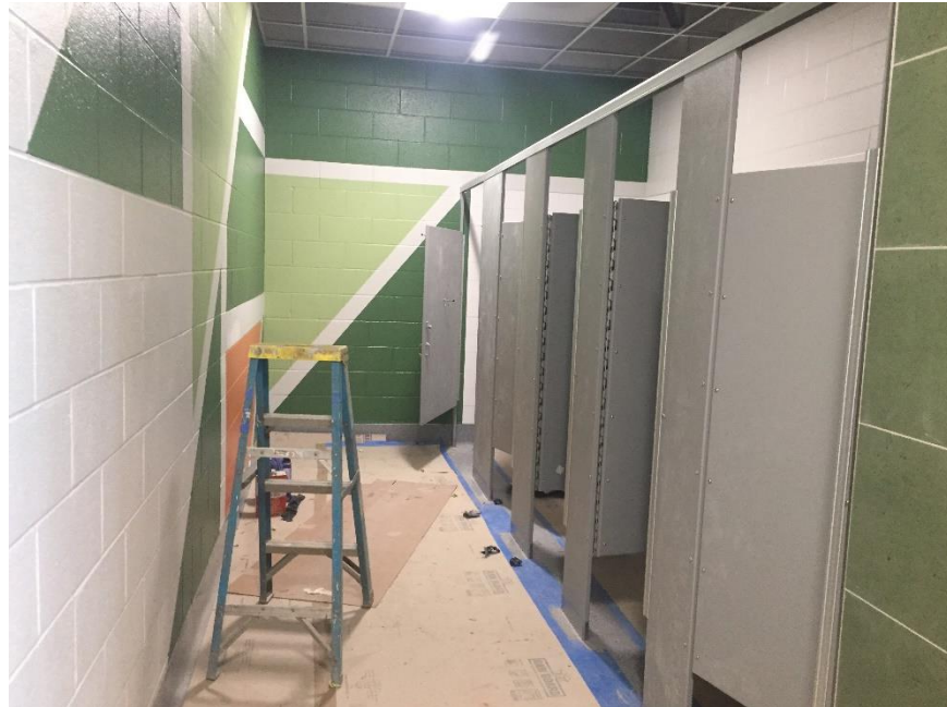
Toilet partitions and painting Area C