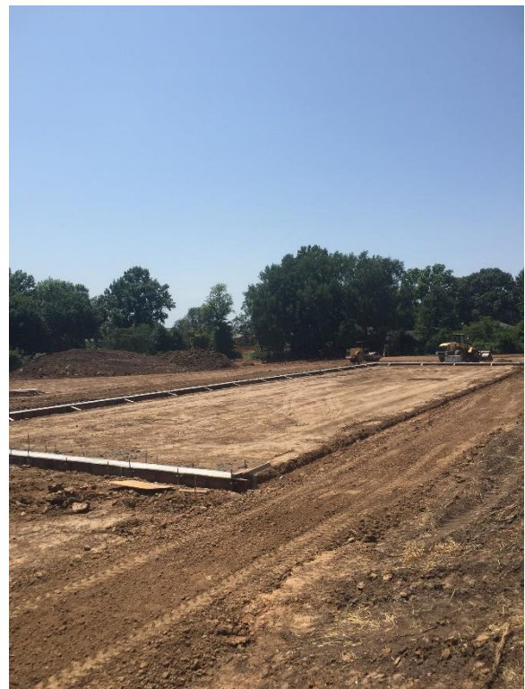
Pouring soft play playground curbs and grading South side.