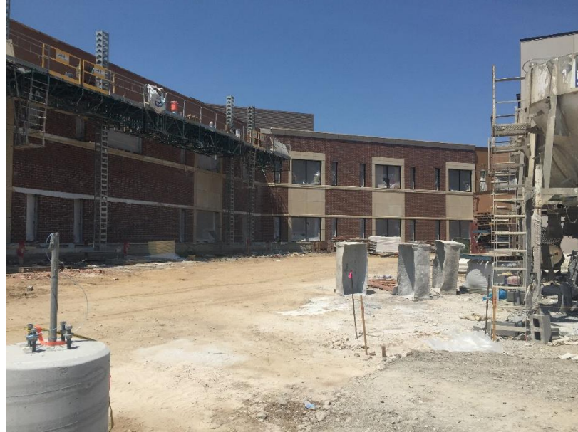
Exterior stone & brick, window frame & window installation Area A & B