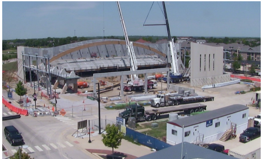
Overview of Jobsite