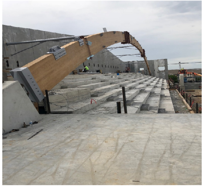
South Part of Beam 1