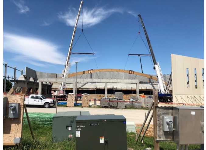
Glulam Beam 1