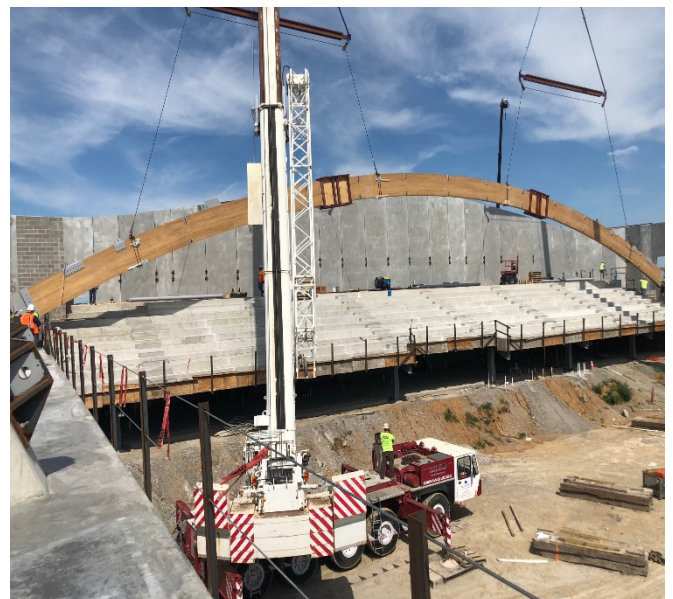
Glulam Beam 1