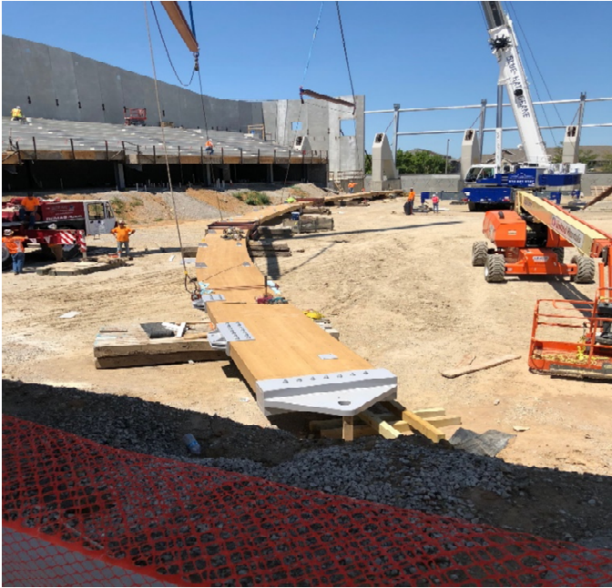
Glulam Beam 1 Layout