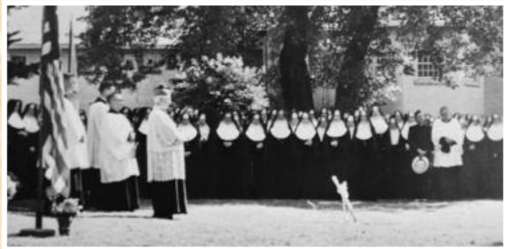
Sisters of Mercy assemble to witness groundbreaking activities in 1958.

freshman class at McAuley. After months of preparation and construction, the long awaited day arrived – September 8, 1960 – when clergy, religious, faculty and students gathered to participate in the opening Mass and the cornerstone-laying activities. Thus began the heritage of McAuley High School.