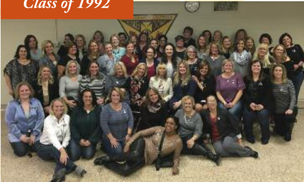
Class of 1992