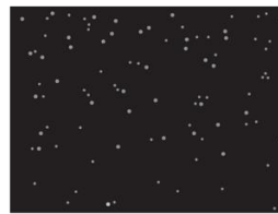
Just the Right Amount