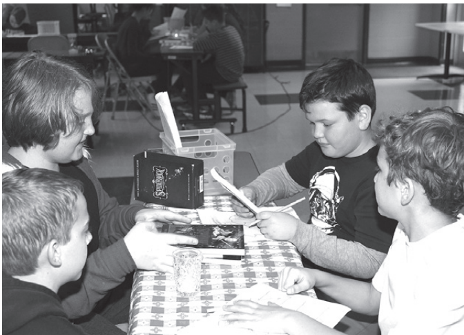
Members of the Middle School TUFS (Teaming up for Success) club and Bennett students talking about their favorite books during a literary-themed “Speed Dating” event.