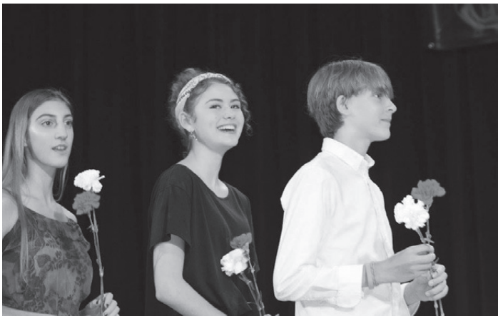
Continuing an Onteora tradition, each student was given two flowers—a red one to keep, and a white one to give away to someone who had helped him or her succeed in Middle School.