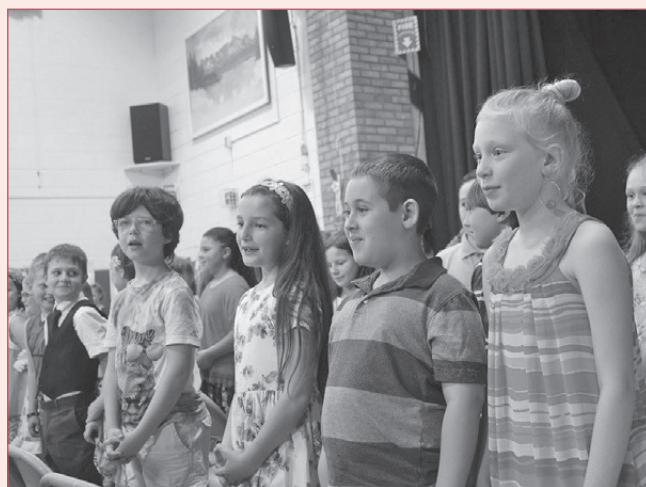
Woodstock’s Grade 3 students marked their upcoming transition to Bennett School with a luau-themed moving up ceremony.