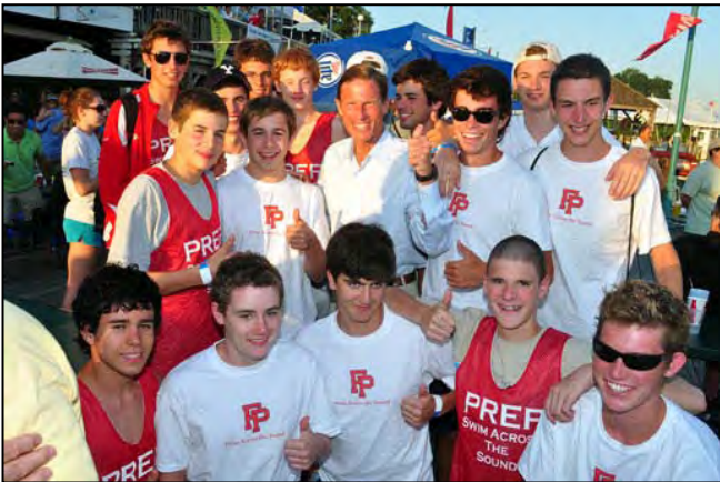
Prep students participate in Swim Across the Sound.