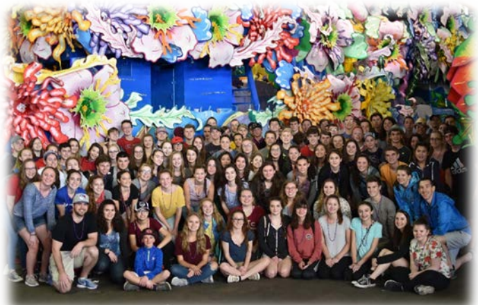
Mardi Gras World