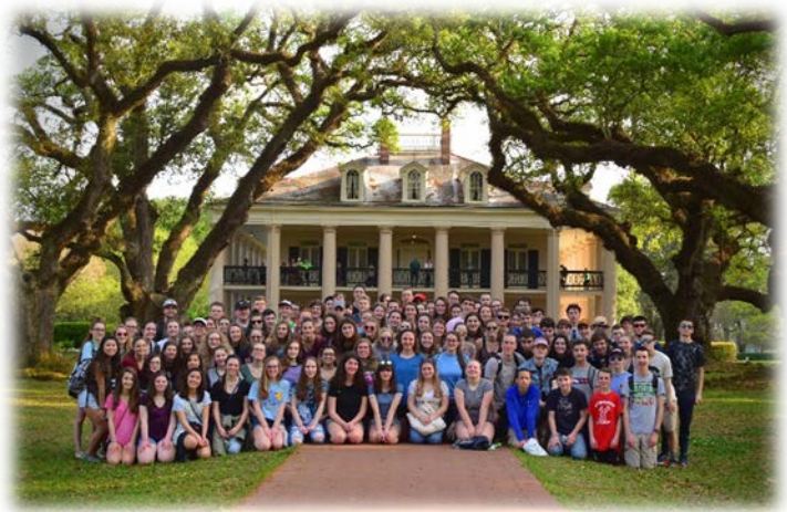
Oak Alley Sugar/Slave Plantation