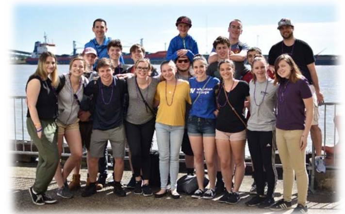
Seniors at Jackson Square on Mississippi River