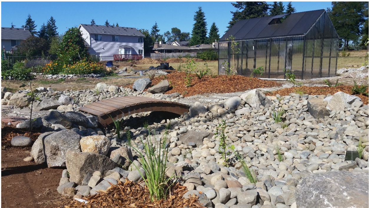
The new Rain Garden includes a foot bridge and a variety of native plants.

September 24 th 2016 was a particularly special day, in the Shark Garden, when 457 volunteers from NAIOP came to volunteer on the New Start campus. About a third of them worked in the garden area, serving around 914 hours! The NAIOP brought with them an estimated $164,000 worth of materials and equipment donations to the campus and around $55,000 of that was spent in the Shark Garden. Other parts of the school campus received improvements that included landscaping, painting, new signage, new picnic tables, and various other repairs. We are very grateful for all of these improvements. Photos and videos can be seen on our Facebook page from that day.