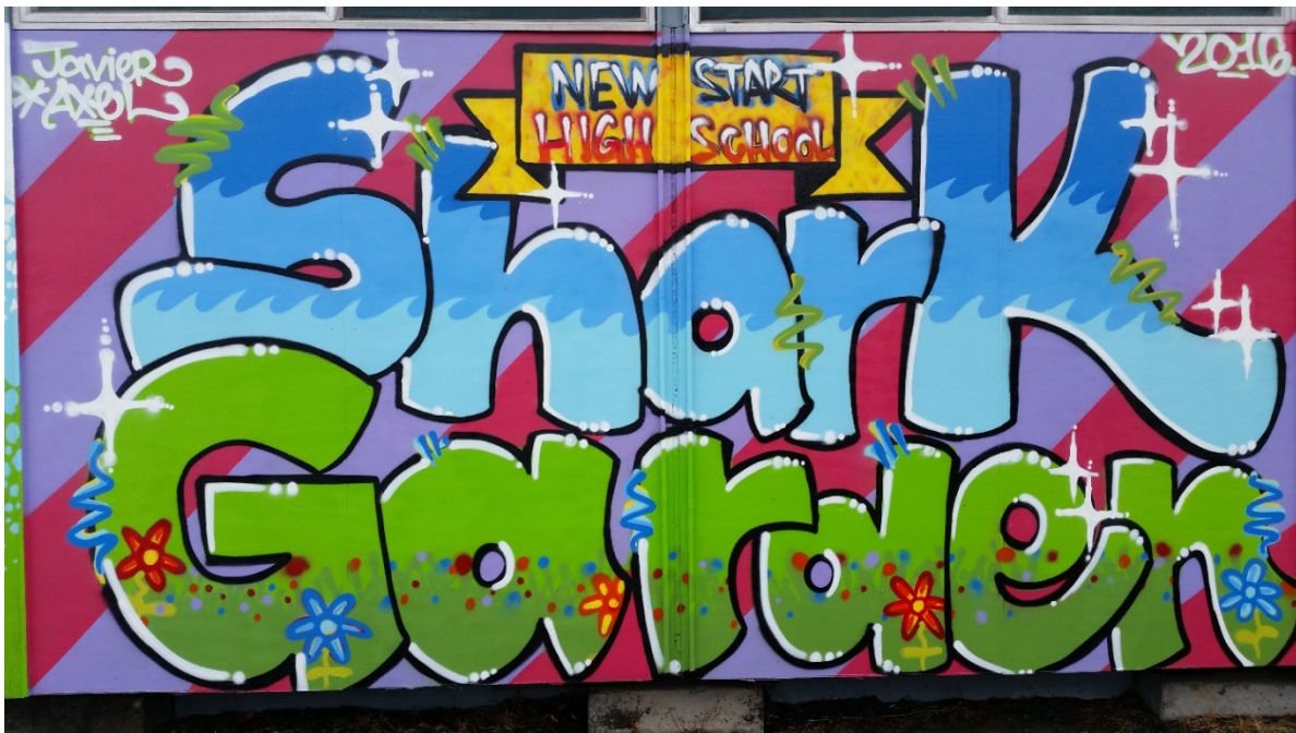
The new Shark Garden mural. This image will likely be the cover of our Thank You cards.

storage space. A gravel road was added to connect the western entrance to a new southern arbor gate entrance. Four large bed areas were prepared as public pea patches to be run by the Burien Parks Department. Another landmark was reached when a new water meter was funded and installed, by the community, so that the garden will now have its own water supply. The $8,000 price tag for the water meter was split between the Highline School District and individual donors. The new 400 square foot demonstration rain garden was completed and planted with native plants. The greenhouse was moved from the high school courtyard over to a spot next to the rain garden. A Shark Garden mural was created by students on the school portable wall, facing the garden. The fence along the western side of the garden was also given a fresh coat of paint. All of these improvements have really started to give the garden an identity in the community.