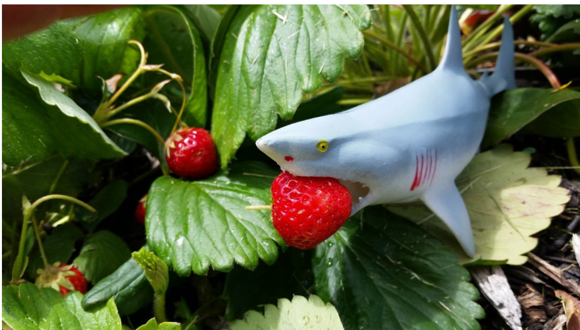
Example of one of our most popular Facebook posts, our mascot showing what was fresh that day.

Our Facebook page can be found here: https://www.facebook.com/theSharkGarden/