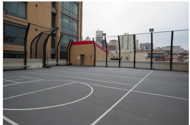
Rooftop Athletic Space

To learn more about the campaign contact Jaime Tollas: jtollas@sterneschool.org .