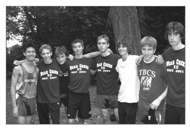
Bear Creek Cross Country boys at the state meet.