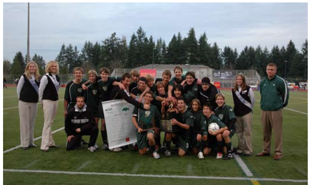
Boys Varsity Soccer team after their state championship win.