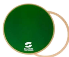
Salyers SPAD-12D 12" Double-Sided Practice Pad