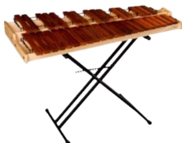
3.0 Octave Practice Marimba with Stand