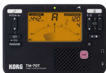
Korg TM-70T Metronome/Tuner