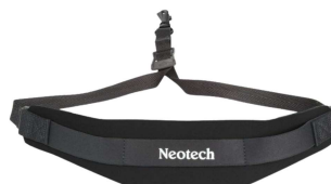
Padded Neckstrap with Closure