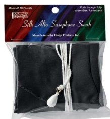
Silk Alto Saxophone Swab