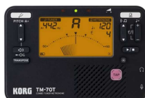
Korg TM-70T Metronome/Tuner