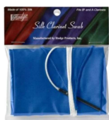
Silk Clarinet Swab