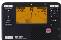
Korg TM-70T Metronome/Tuner