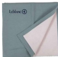
Cotton or Microfiber Cleaning Cloth