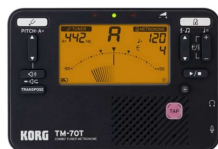
Korg TM-70T Metronome/Tuner