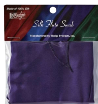
Silk Swab for Flute