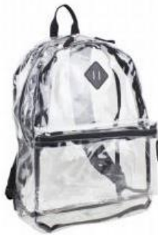
Example of permitted clear backpack.

Student Handbook 2018–2019: In an effort to improve the safety measures currently in place, CFISD requires all high school and middle school students to use clear backpacks. Students participating in an extracurricular activity are permitted to carry non-transparent bags to store items pertaining to their particular activity (i.e. band, athletics, etc.). Upon entry into the school, all extracurricular activity bags must be stored in lockers or designated areas. All bags are subject to search. Additionally, the maximum size for non-transparent bags that students in grades 6–12 will be permitted to carry during the school day, such as lunch kits, pencil bags and purses, will be 6" x 9". Elementary school students will be allowed to continue using traditional backpacks.