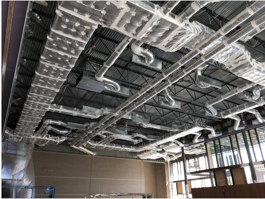
Ductwork at Dining