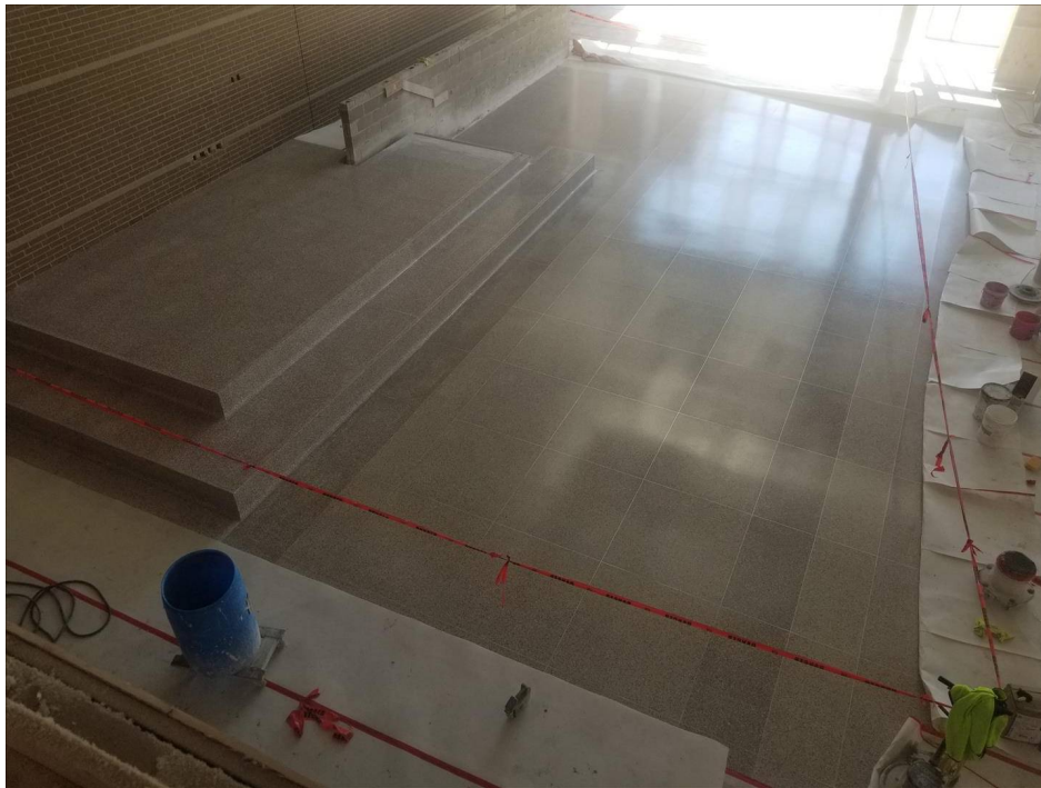
Completed Terrazzo at Dining