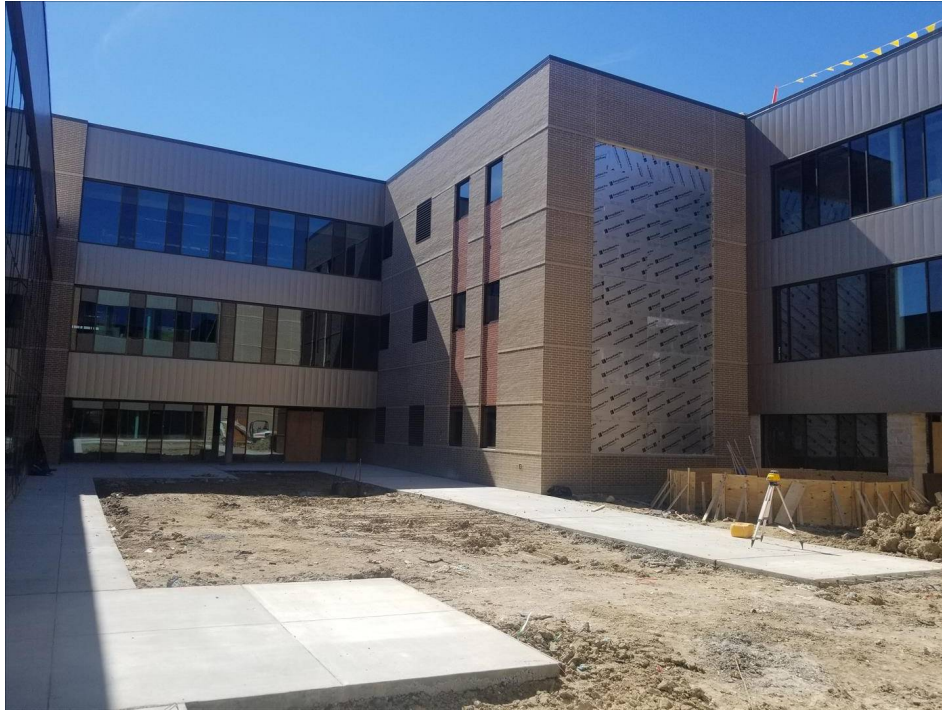
Learning Courtyard with sidewalk install underway