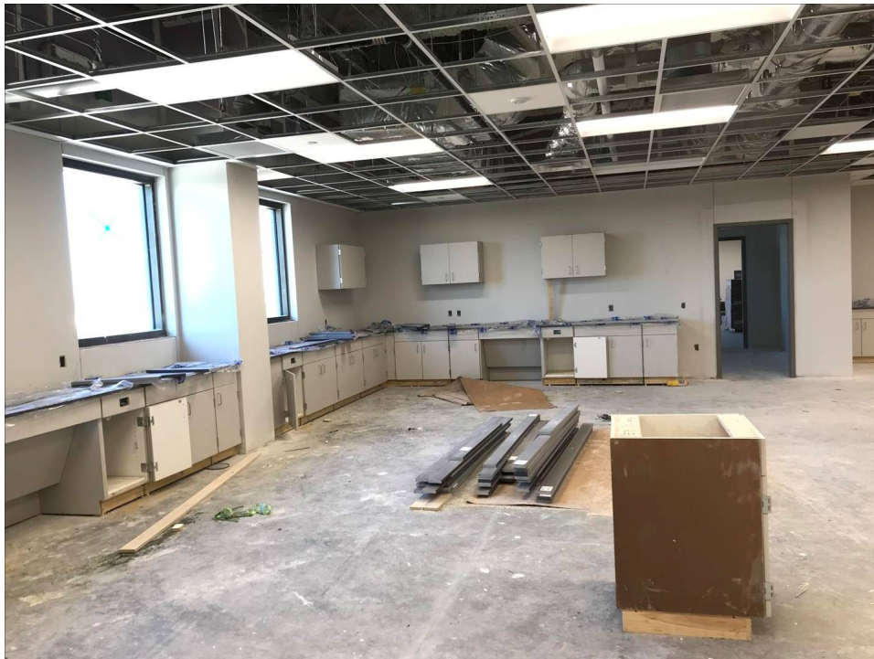
Science classroom casework