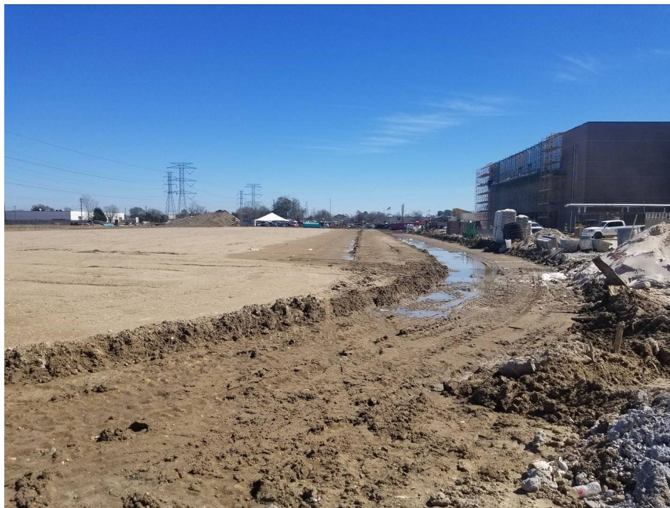
Earthwork at Track