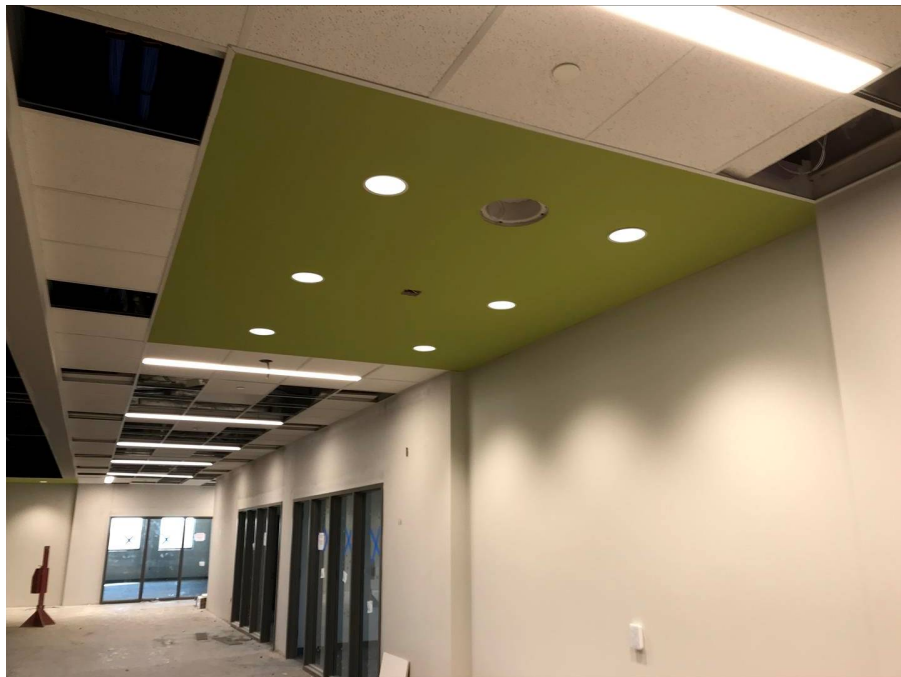
Classroom corridor ceiling install ongoing