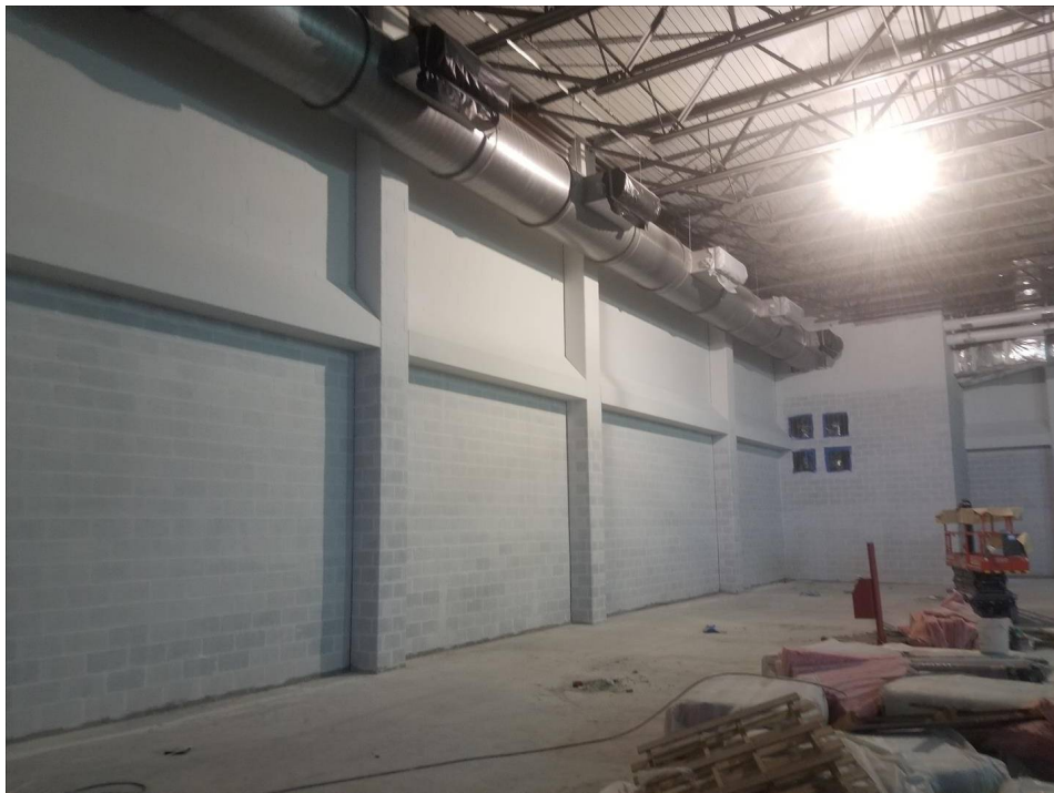
Interior of Gym primed for painting