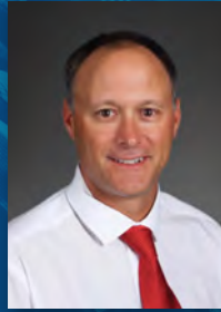
Bobby Thompson Middle School Dean of Students