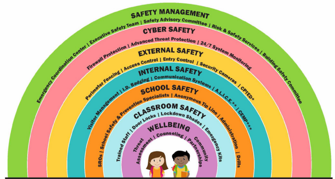
Layered School Safety

This document highlights the specific steps that LWSD has taken in each of these layers. Our hope is that by better understanding what resources are available, our staff, students and visitors will better be able to use or access these resources when needed.