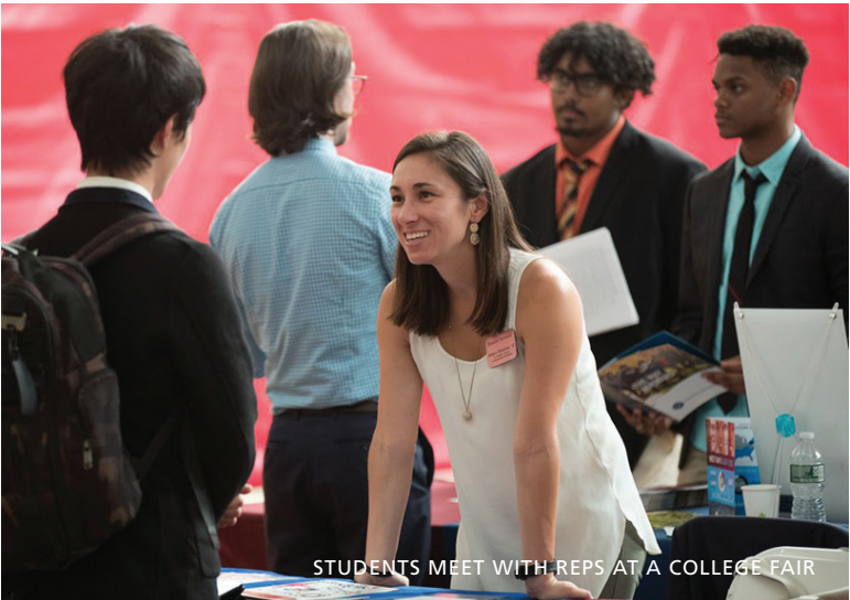
STUDENTS MEET WITH REPS AT A COLLEGE FAIR

10 college admission representatives visited in-person to conduct mock interviews with juniors