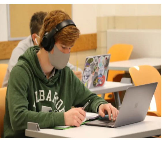
Delbarton Students now Accustomed to the "New Normal" of Masks in the Classroom

The Delbarton varsity football team went undefeated, but their season was cut short due to a last minute positive Covid case a few minutes before kickoff. The varsity soccer team also did very well, only losing one game during the season. Same goes for the middle school track team, losing only one game throughout the season. Unfortunately, because of a lack in schools willing to participate, middle school football was canceled. 7th grade students have also begun to work on their science fair projects, with a wide range of different projects being chosen. And there is some bett