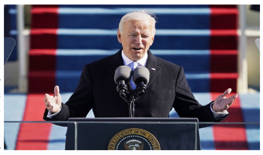
Newly Inaugurated President Biden Addresses the Nation on January 20

Trump has been elected he has spread misinformation and demanded his political opponents be "locked up" just for disagreeing with him. These strategies are ones used by dictators to rise to power not the President of the United States. This was an attack on the legislative branch, our democracy, and the American People. Donald Trump failed to uphold his oath, "I do solemnly swear that I will faithfully execute the Office of President of the United States, and will to the best of my ability, preserve, protect and defend the Constitution of the United States."