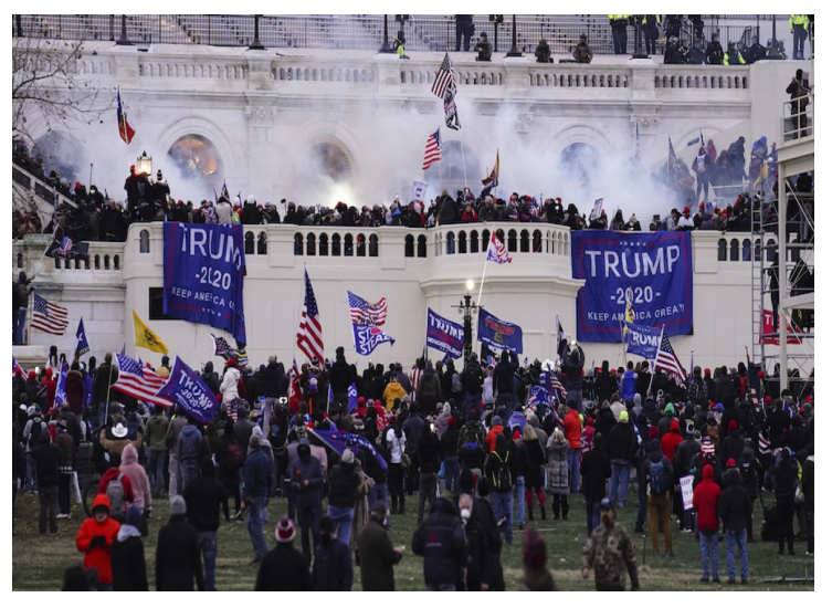
Pro-Trump Rioters Briefly before Breaching the Capitol on Jan. 6th

This was a sad day for our democracy and shows how fragile our system really is. Ever since